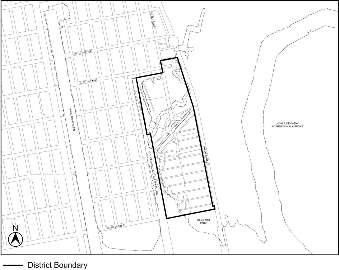
Map 2 - Special Coastal Risk District 2, in Hamilton Beach, Community District 10, Borough of Queens (6/21/17)