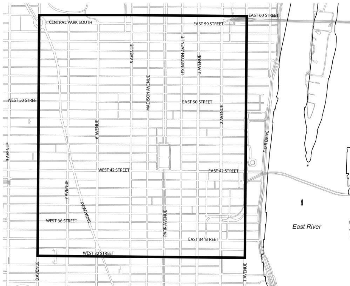
Map 2 — Area where public parking lots are not permitted in the downtown Manhattan Core