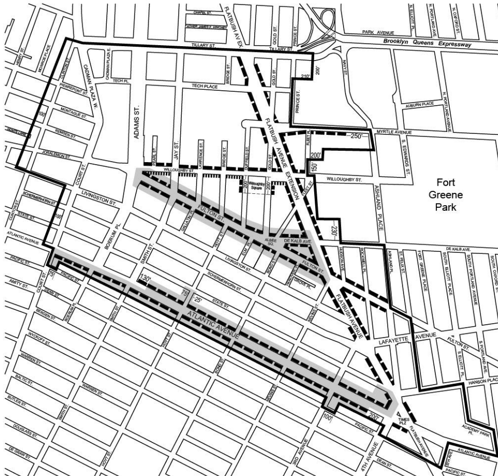
Map 2 — Ground Floor Retail Frontage (6/6/24)