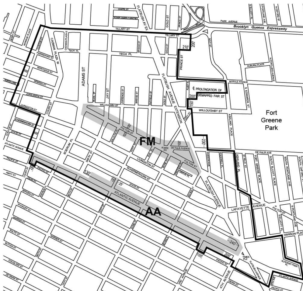
Map 1 — Special Downtown Brooklyn District and Subdistricts (12/10/19)