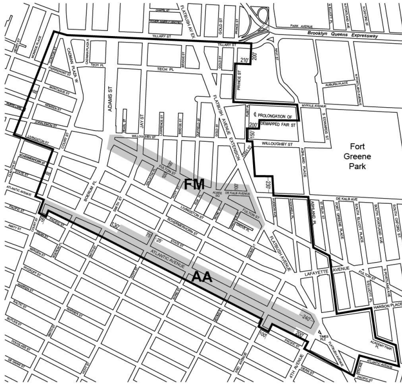
Map 1 — Special Downtown Brooklyn District and Subdistricts (12/10/19)