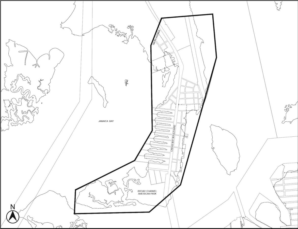
Map 1 - Special Coastal Risk District 1, in Broad Channel, Community District 14, Borough of Queens (6/21/17)