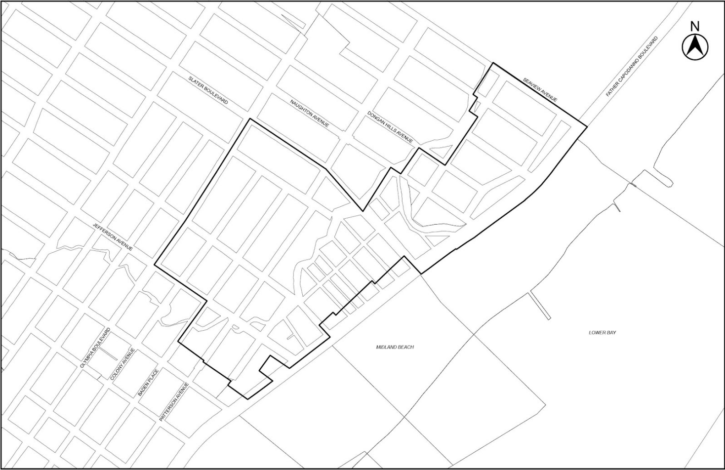
Map 3 - Special Coastal Risk District 3, encompassing New York State Enhanced Buyout Areas in Graham Beach and Ocean Breeze, Community District 2, Borough of Staten Island (9/7/17)