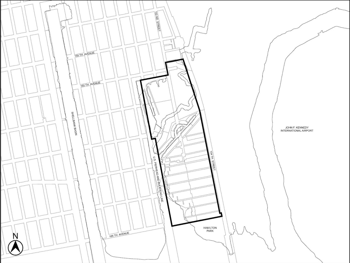
Map 2 - Special Coastal Risk District 2, in Hamilton Beach, Community District 10, Borough of Queens (6/21/17)