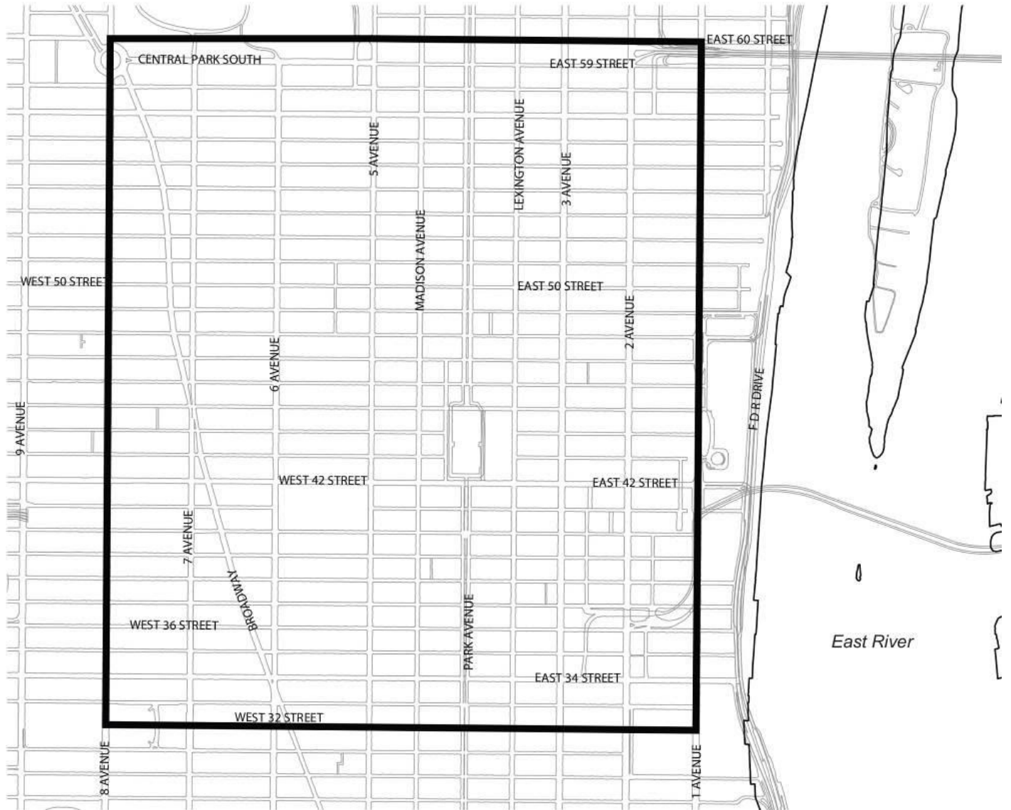
Map 2 — Area where public parking lots are not permitted in the downtown Manhattan Core