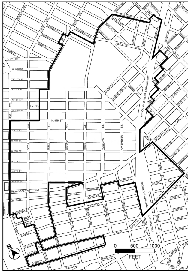
— Anti-harassment area